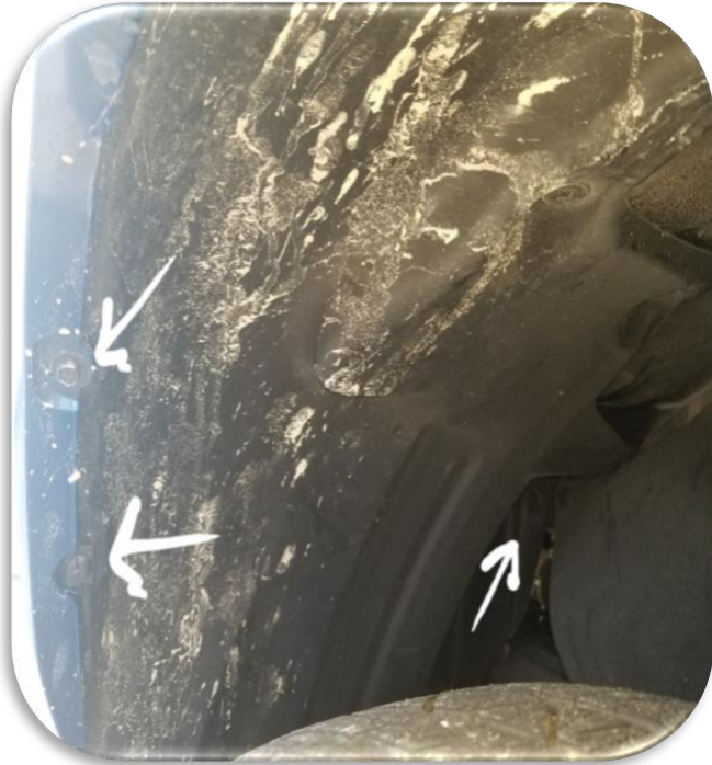
Bottom view of Stock-OEM Bumper